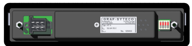
AT13 back view exclusive of bracket

The keypad unit can be parameterised via 4 DIP switcher. Additionally we provide a free parameterising software for individual modification of the default settings.