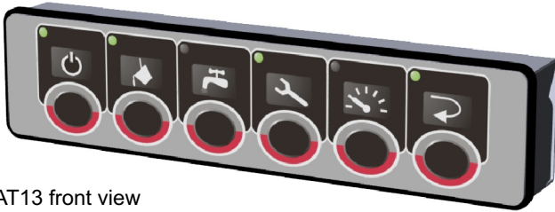
AT13 front view